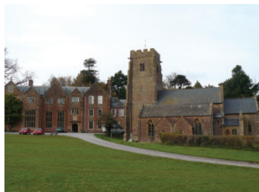
Nettlecombe church and manor house in close partnership: a Raleigh probably built the church, Trevelyan extended it, and Trevelyan and their relations were rectors continuously between 1724 and 1851.