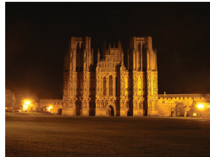
West front, Wells cathedral.