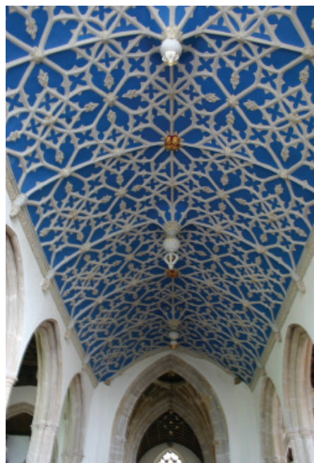
The nave ceiling, Axbridge, 1636.